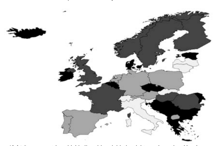
Light Grey. – countries with binding citizen initiative rights on the national level Grey – countries with agenda initiative rights on the national level only Dark Grey – countries with local/regional citizen initiative rights only Black – countries with NO citizen initiative rights at all.

The instrument of the initiative plays a very specific role in the political process: instead of the promise of a possible majority, initiatives gives societal groups the option of offering innovations and reforms to the parliament or even the whole electorate. 21 European countries have some form of initiative process today: