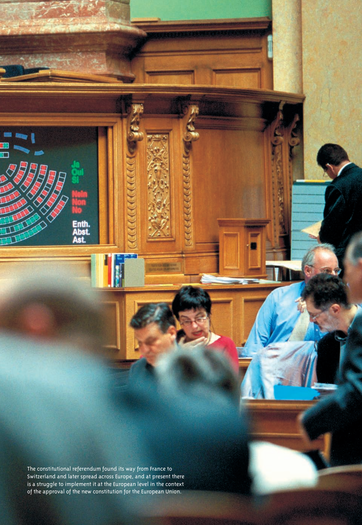
The constitutional referendum found its way from France to Switzerland and later spread across Europe, and at present there is a struggle to implement it at the European level in the context of the approval of the new constitution for the European Union.